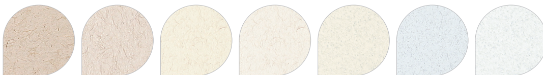
KRAFT Vellum 30% pcw T C