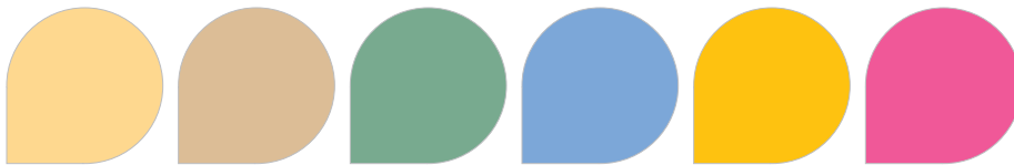
SUNFLOWER Vellum 30% pcw T C