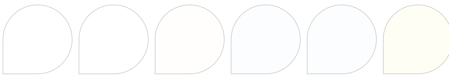
PURE WHITE 96 bright Felt, Laid, Linen, Satin, Smooth, Vellum W T C DTC

W = Writing, T = Text, C = Cover, DTC = Double-Thickness Cover