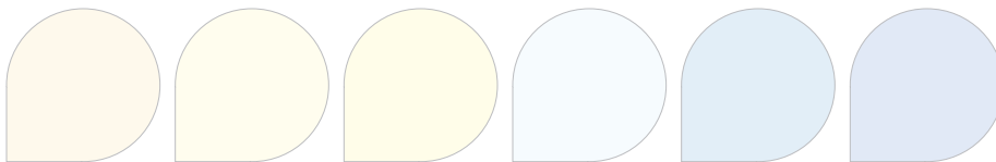
NATURAL Felt, Laid, Linen, Smooth, 25% Cotton Smooth 30% pcw W T C