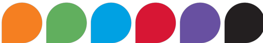
WARM RED Vellum 30% pcw T C