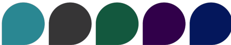
NORDIC BLUE Wove 30% pcw T C CHARCOAL GRAY Grandee, Wove 30% pcw T C HEMLOCK Cambric, Wove 30% pcw T C EGGPLANT Cambric, Wove 30% pcw T C BLAZER BLUE Cambric, Grandee, Wove 30% pcw T C DTC