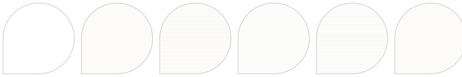
PLATINUM WHITE 99 bright Cambric, Smooth, Wove W T C DTC P ULTIMATE WHITE 98 bright Cambric, Enhance, Grandee, Pinstripe, Smooth, Super-smooth, Wove W T C DTC P ULTIMATE WHITE LINES Supersmooth W T C DTC BRIGHT WHITE 90 bright Cambric, Grandee, Pastelle, Pinstripe, Smooth, Super-smooth, Ultrafelt, Wove 30% pcw W T C DTC P BRIGHT WHITE LINES Supersmooth 30% pcw W T C DTC 100% PC WHITE Smooth, Wove 100% pcw W T C DTC

W = Writing, T = Text, C = Cover, DTC = Double-Thick Cover, P = Pressure-sensitive Label