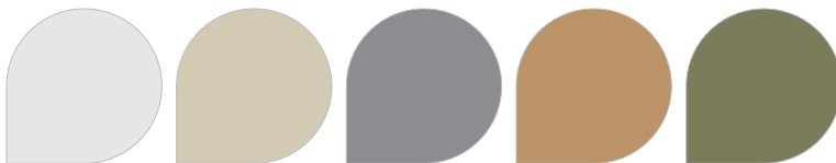
MIST GRAY Grandee, Wove 30% pcw T C KHAKI Grandee, Wove 30% pcw T C SMOKE GRAY Grandee, Wove T C CHINO Grandee, Wove 30% pcw T C OLIVE Grandee, Wove 30% pcw T C