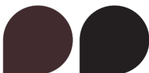
MAHOGANY Cambric, Wove T C DTC MIDNIGHT BLACK Cambric, Grandee, Wove 30% pcw T C DTC