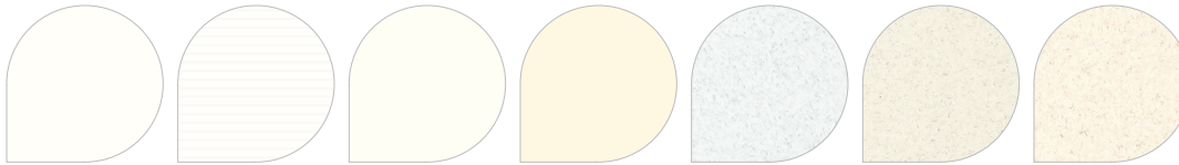
SOFT WHITE Grandee, Pastelle, Pinstripe, Smooth, Supersmooth, Ultrafelt, Wove 30% pcw W T C DTC P SOFT WHITE LINES Supersmooth 30% pcw W T C DTC NATURAL WHITE Cambric, Pastelle, Pinstripe, Smooth, Wove W T C DTC P IVORY Cambric, Enhance, Grandee, Supersmooth 30% pcw W T C GLACIER MIST Supersmooth, Wove 30% pcw W T C DTC SAND STONE Wove 30% pcw W T C DESERT HAZE Wove 30% pcw W T C